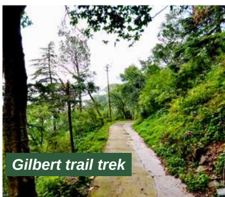
Gilbert trail trek