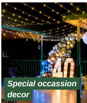
Special occasion decor