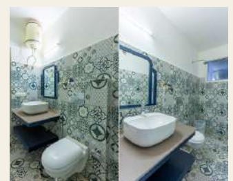
09 Walk in the Rain