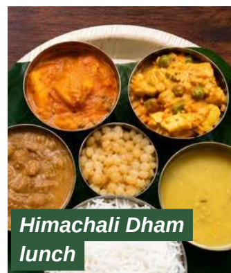
Himachali Dham lunch