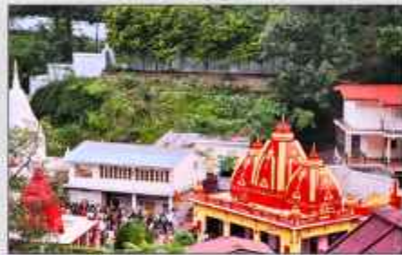
Kainchi Dham Temple