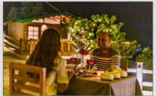
Candle Light Dinner