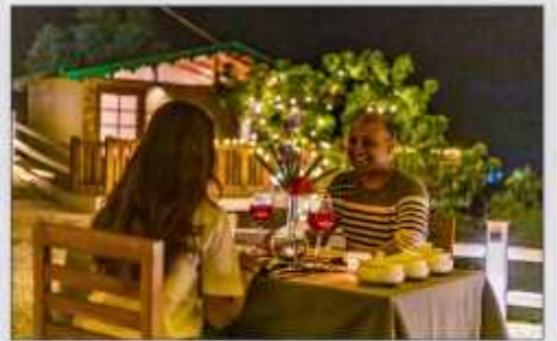
Candle Light Dinner