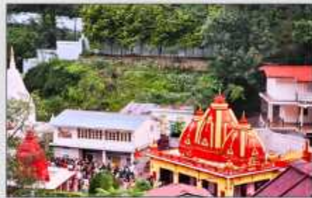
Kainchi Dham Temple