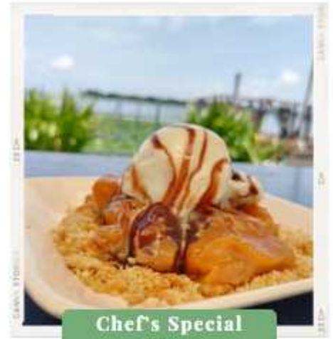
Chef's Special Menu