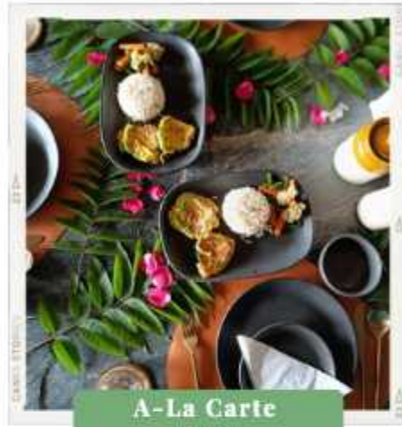
A-La Carte Menu