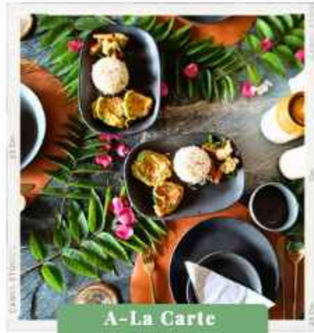
A-La Carte Menu