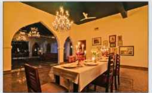
Candle Light Dinner