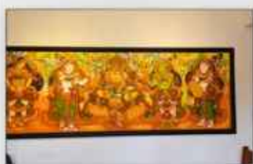
Mural Art Museum