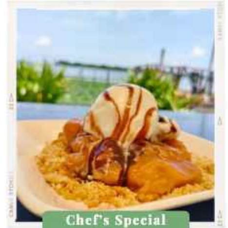
Chef's Special Menu