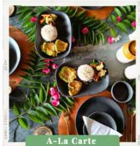
A-La Carte Menu