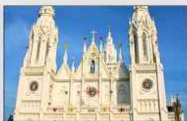
Our Lady of Dolours Basilica, Puthenpally