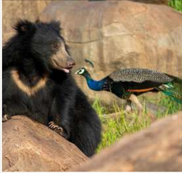
Daroji Sloth Bear Sanctuary