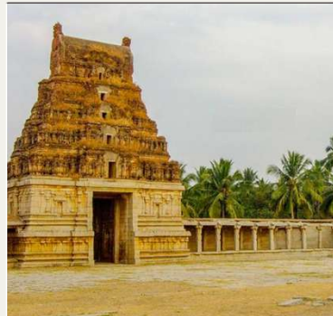
Bhima's Gate & Pattabhirama Temple