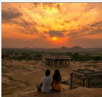
Sunset at Hemakuta Hill