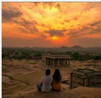
Sunset at Hemkuta Hill