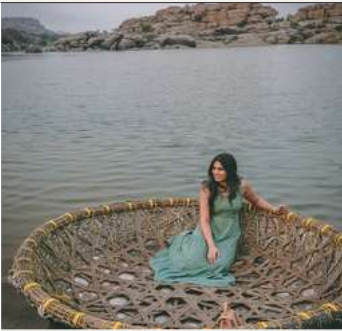
Coracle ride on the Tungabhadra River

Pro tip: get a tourist guide as he/she knows different languages and explains about the history better