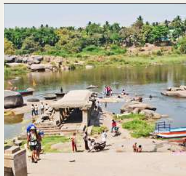
Hippie Island (Virupapur Gadde)

Note* All these sites are 1-1.5 Hours away from Seclude Hampi 1800