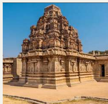
Hazara Rama Temple

Note* All these sites are 1 Hour away from Seclude Hampi 1800