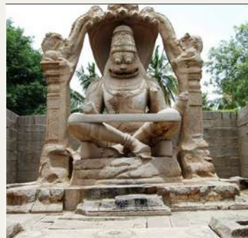
Ugra Narasimha & Badavalinga Temple