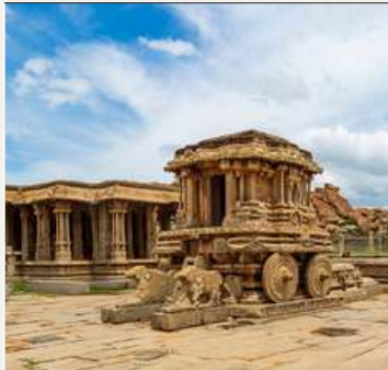
Vitthala Temple, Stone Chariot

Pro tip: get a tourist guide as he/she knows different languages and explains about the history better