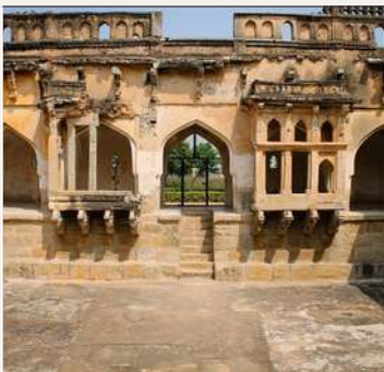
Visit Queen's Bath