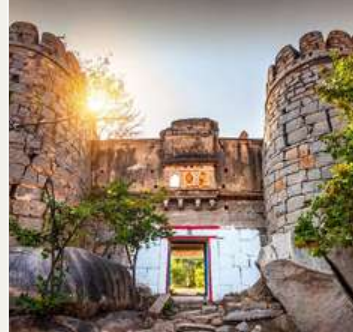
Anegundi Village Visit