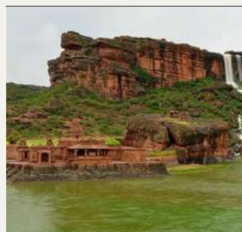
Badami Akka Tanga hills

Note* All these sites are 1 Hour away from Seclude Hampi 1800 Badami Akka Tanga hills- 3 hours from the property