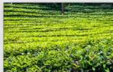
Tea Gardens Visit