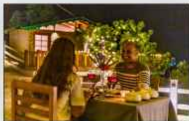
Candle Light Dinner