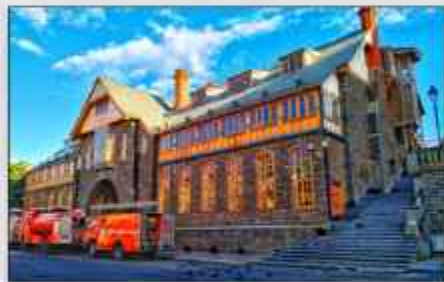
Shimla Heritage Walk