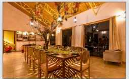
Candle Light Dinner