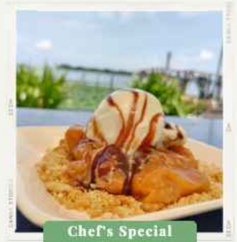
Chef's Special Menu