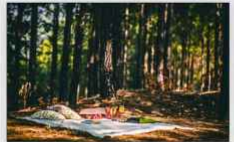
Picnic in the Forest