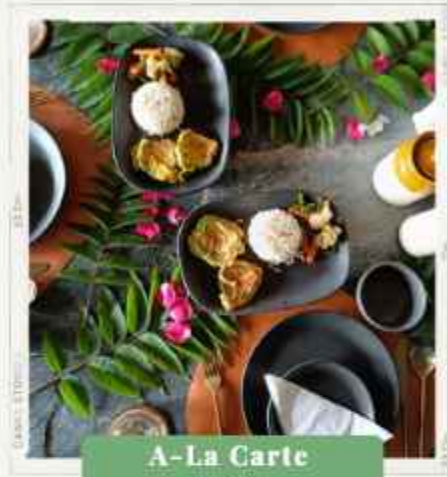
A-La Carte Menu