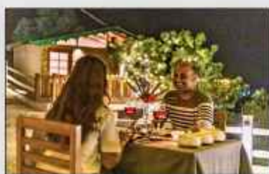
Candle Light Dinner