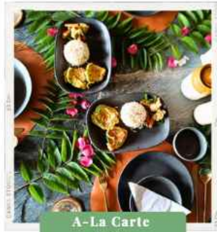
A-La Carte Menu