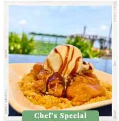
Chef's Special Menu