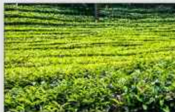
Tea Gardens Visit