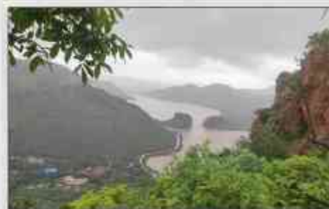
Explore Sandur Hills