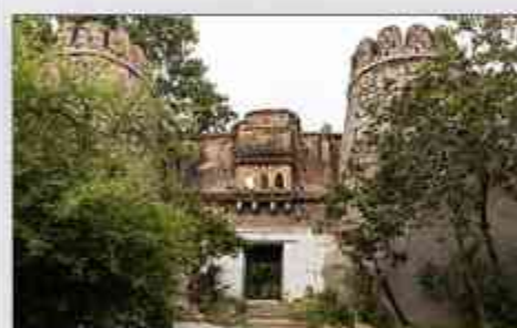
Visit Anegundi Village