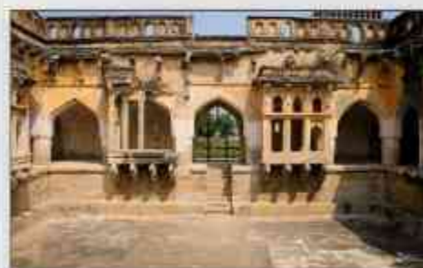
Visit Queen's Bath