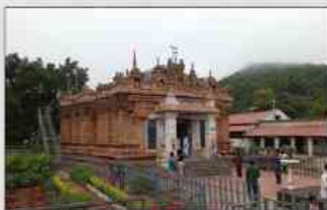
Visit Sandur Fort