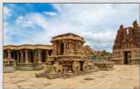
Shree Vijaya Vitthala Temple