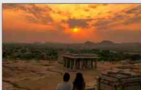
Sunset at Hemakuta Hill