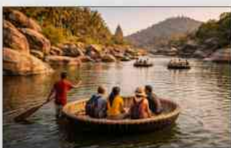
Coracle ride at Tungabhadra River