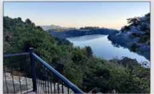
Jhutia Lake Visit