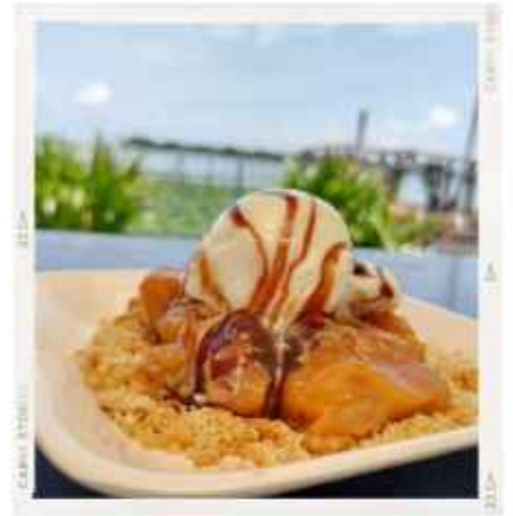
Chef's Special Menu