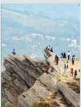
Chauli Ki Jali