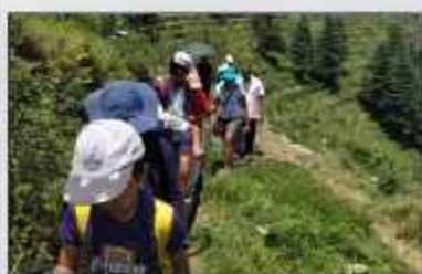
Talla Ramgarh Trek