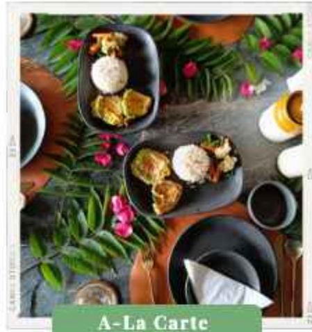
A-La Carte Menu