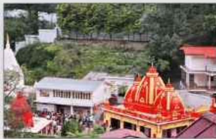
Trip to Kainchi Dham