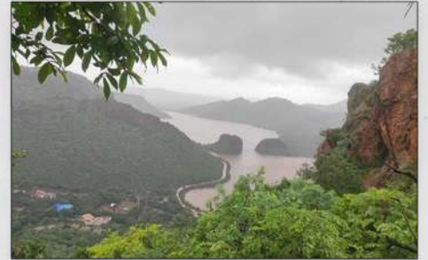
Explore Sandur Hills