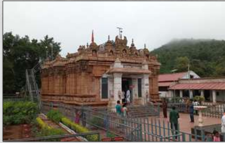
Visit Sandur Fort