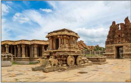
Shree Vijaya Vittala Temple