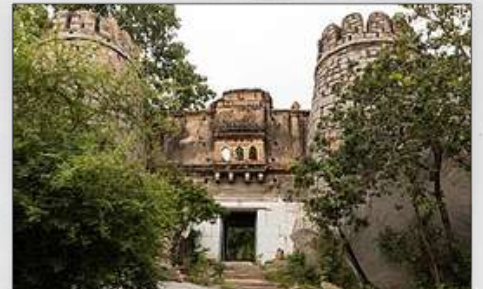
Visit Anegundi Village