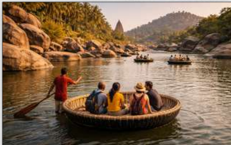
Coracle ride at Tungabhadra River