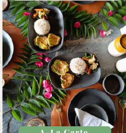
A-La Carte Menu