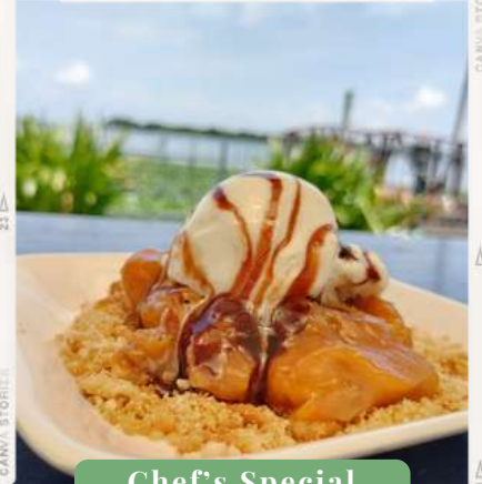
Chef's Special Menu