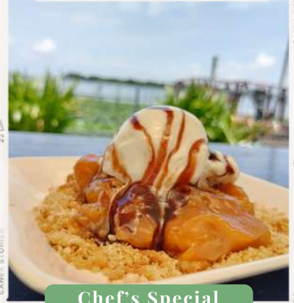
Chef's Special Menu