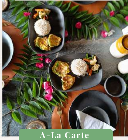
A-La Carte Menu