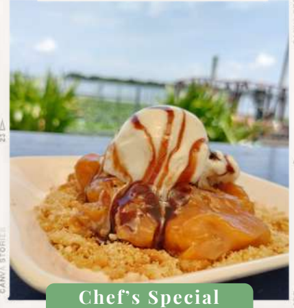
Chef's Special Menu