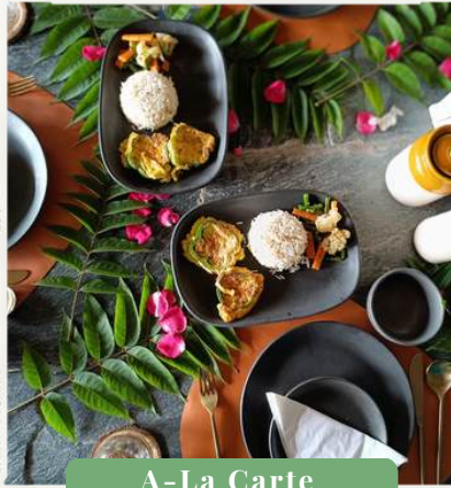
A-La Carte Menu