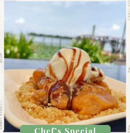
Chef's Special Menu