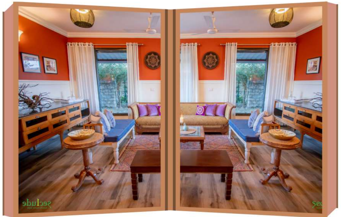
4 Bedroom Villa