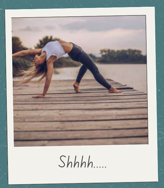
Yoga at the Lake