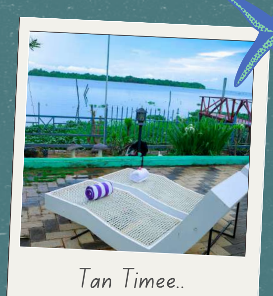
C 1 11.