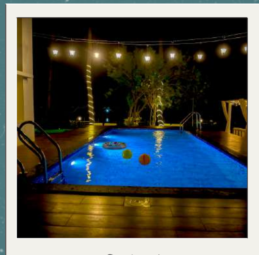
~ Splash ~