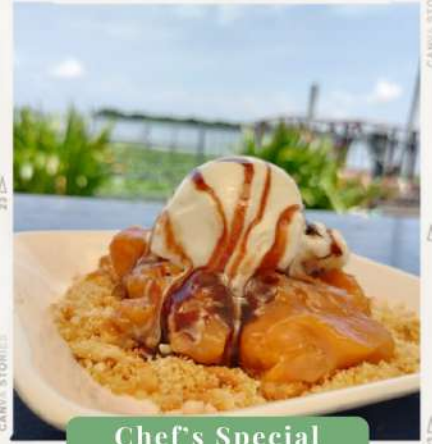
Chef's Special Menu