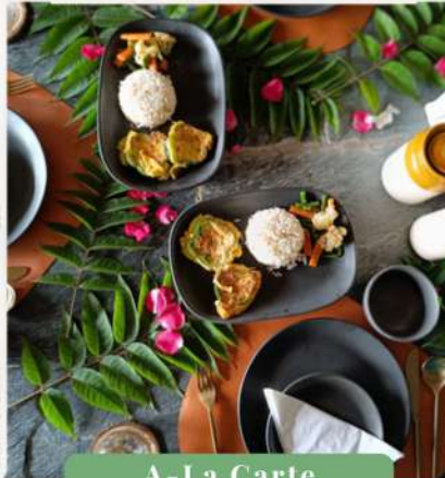
A-La Carte Menu