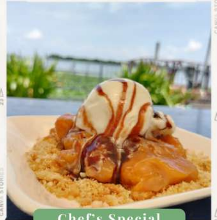
Chef's Special Menu