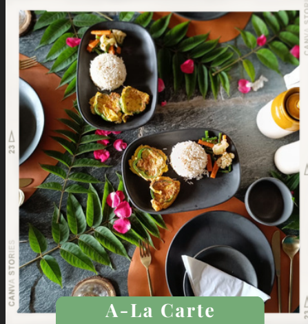
A-La Carte Menu