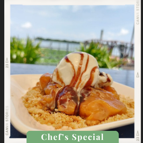
Chef's Special Menu