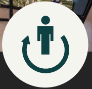
ROOM 1 - PUKHRAJ