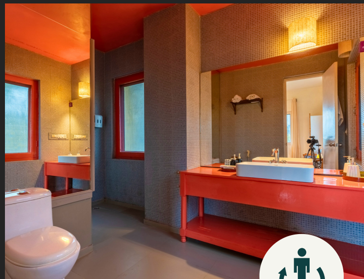
ROOM 2 - TITLI