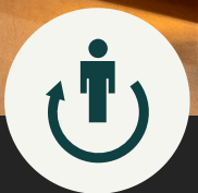
ROOM 2 - PANNA