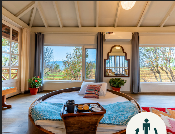
ROOM 1 - BHANWARA