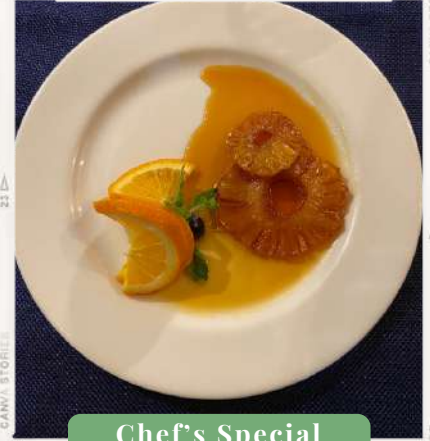
Chef's Special Menu