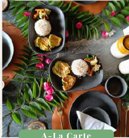
A-La Carte Menu