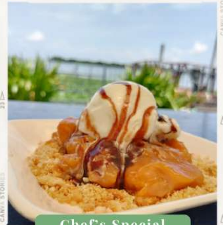
Chef's Special Menu