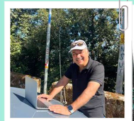
Give your dream team their dream vacation...