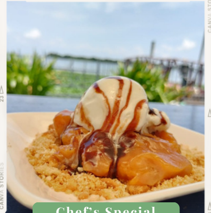
Chef's Special Menu