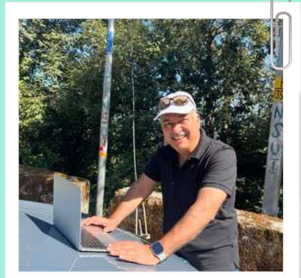
Give your dream team their dream vacation...