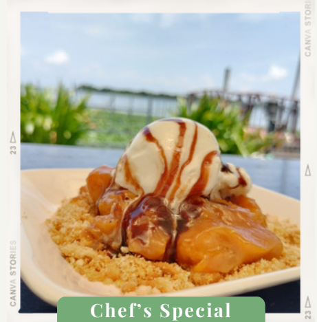
Chef's Special Menu