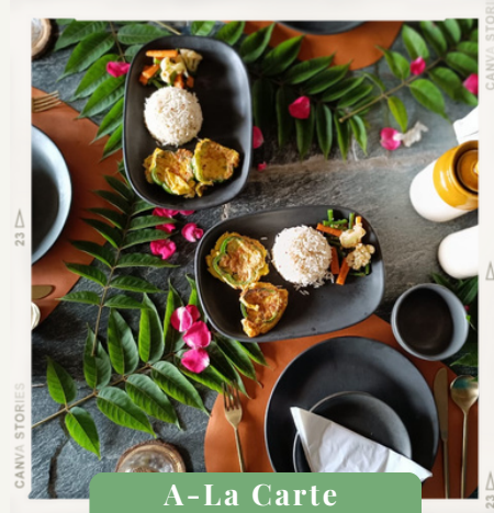
A-La Carte Menu