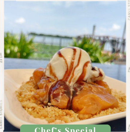
Chef's Special Menu