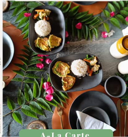
A-La Carte Menu