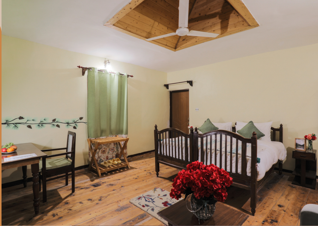
THE PEEPAL TREE