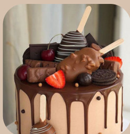
Birthday & Anniversary package